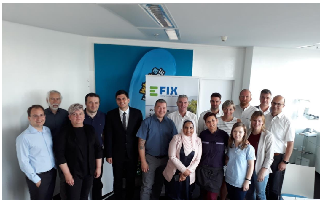
b) Project Synergies in Warsaw